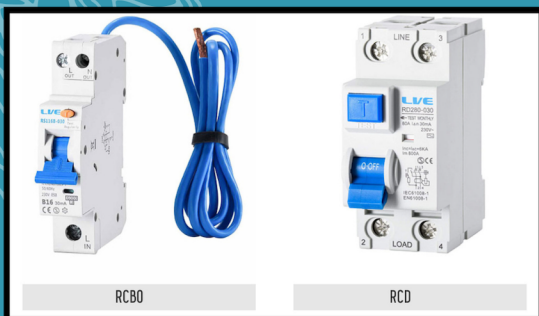
RCBO | RCD